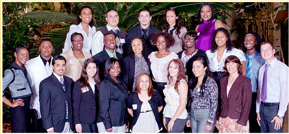
The 2011 recipients of the Kennedy-King Memorial College Scholarship Fund.

This is the time of year when we experience one of the great joys of working at a community college. It is graduation time, and students who came to us just a few years ago with hopes and dreams, are now moving on with their lives with certificates and degrees that exemplify student success.